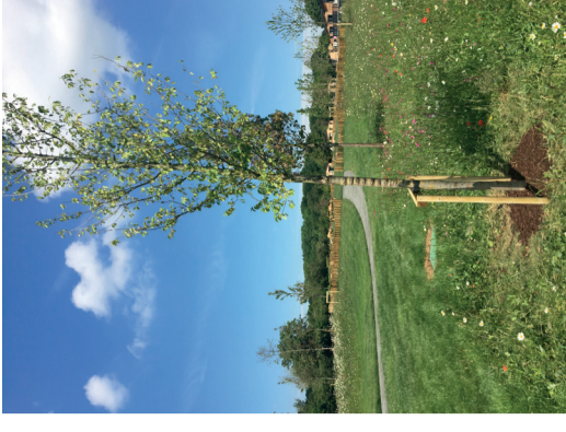
Proposed Woodland Tree Planting